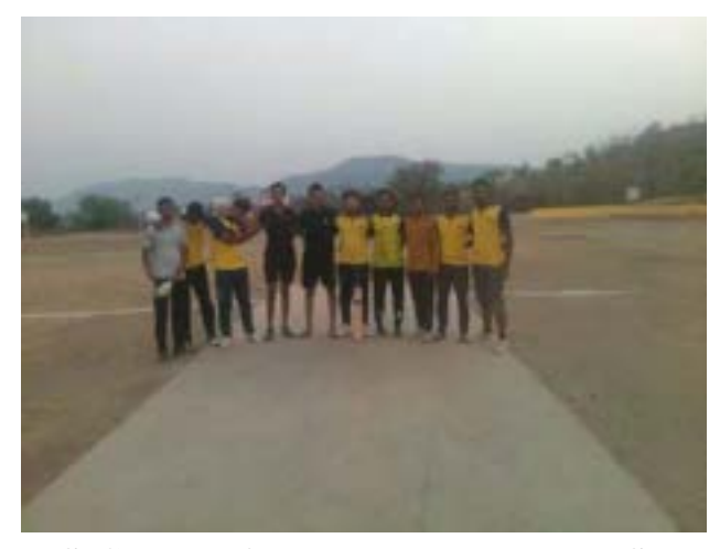
RJS College of pharmacy students at Satara for Cricket Sports Matches organized by Satara College of Pharmacy

In today's era of excessive competition and changing environment, people barely care about our health and have to face its consequences in the later stages of their life. They easily become prey to many life-threatening health issues. Those who are indulged in regular physical activities can easily defend themselves from such diseases. Therefore, playing sports can resolve this concern. The students from second year, Third Year and Final Year B. Pharmacy of Rashtrasant Janardhan Swami College of Pharmacy Kokamthan had participated in Gaurishankar Education Society Satara Sponsored matches of