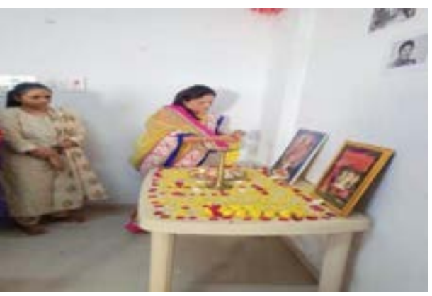
Light lamping by aluminums hand of Guest of Programme