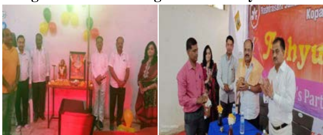
Light lamping ceremony by the auspicious hand of Guest of program along with felicitation of guest by RJS College of Pharmacy