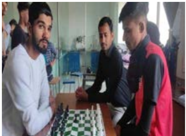
Students of RJS College of pharmacy enjoying outdoor and Indoor Sports activities under Sparsh 2023