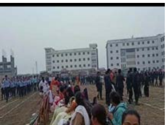
Republic Day Celebration in RJS Campus by Flag Hosting and Various Performance

Republic Day is the day when India marks and celebrates the date on which the Constitution of India came into effect on 26 January 1950. This replaced the Government of India Act 1935 as the governing document of India, thus turning the nation into a republic separate from British Raj. To make people aware about importance of national flag the 74<sup>th</sup> Republic Day was celebrated in Rashtrasant Janardhan Swami Foundations College of Pharmacy, Ayurveda, Homeopathy, Physiotherapy and Nursing, Kokamthan campus on 26 Jan 2023. Entrance of college campus was beautifully decorated with Rangoli, flags,