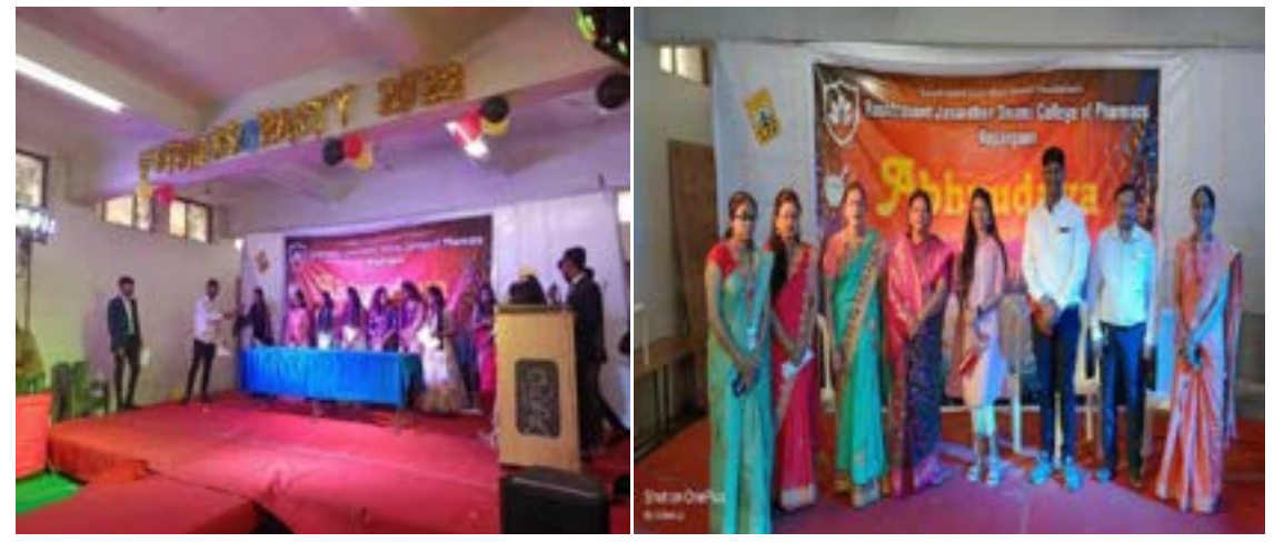
New First Year Pharmacy Students Playing Entraining Games during their introduction and Mr. fresher's and Miss Fresher's of Abhyduya 2023