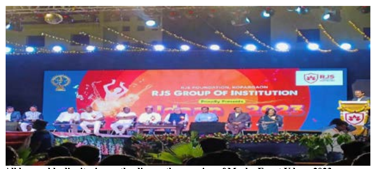
All honorable dignitaries on the dies on the occasion of Megha Event Udaan 2023.