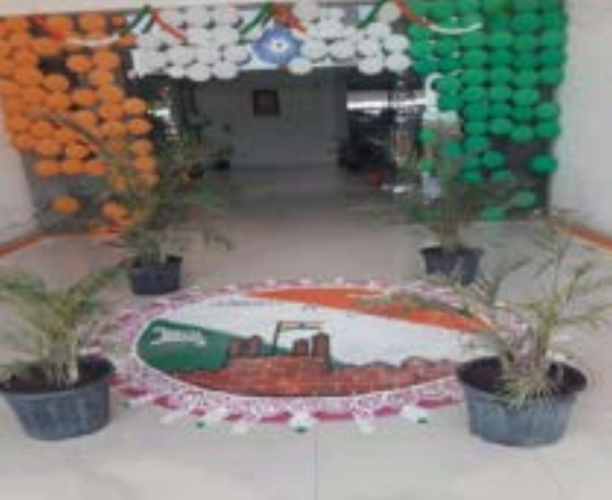
Beautiful Decoration of RJS Campus for 74 th Independence Day Celebration