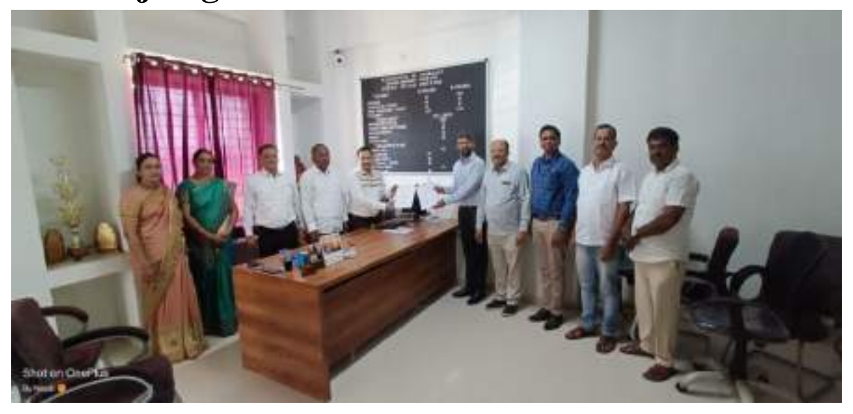
Memorable moment of RJS College of pharmacy with Shodh AdvanTech LLP, Ch. Sambhajinagar Maharashtra

On 1<sup>st</sup> April 2023 the Memorandum of Understanding ("MoU") is entered into by and between Shodh AdvanTech LLP, Ch. Sambhajinagar Maharashtra, India and Rashtrasant Janardhan Swami College of Pharmacy, Kokamthan, Kopargaon-423601 based on students and faculty development programme. These excel in acquisition of knowledge and its