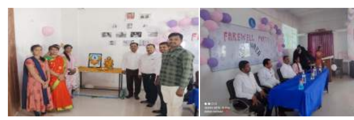
Inauguration and Light Lamping Ceremony along with Programme Preface on the Occasion of Farewell Party of D. Pharmacy at RJS College of Pharmacy Kokamthan