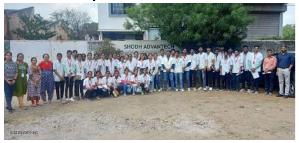
Rashtrasant Janardhan Swami College of Pharmacy, Kokamthan Students with Shodh Advantech , Sambhajinagar.