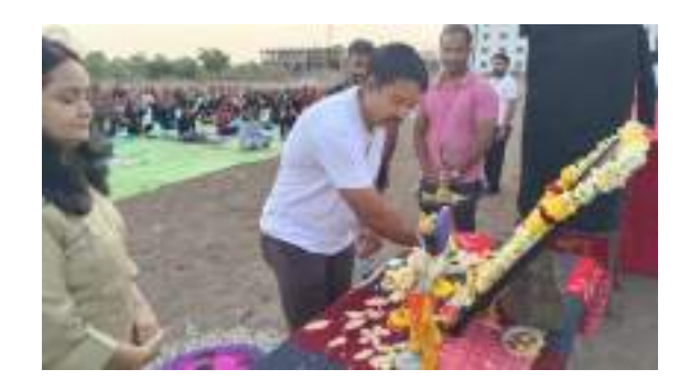
Light lamping by aluminums hand of Guest of Yoga day