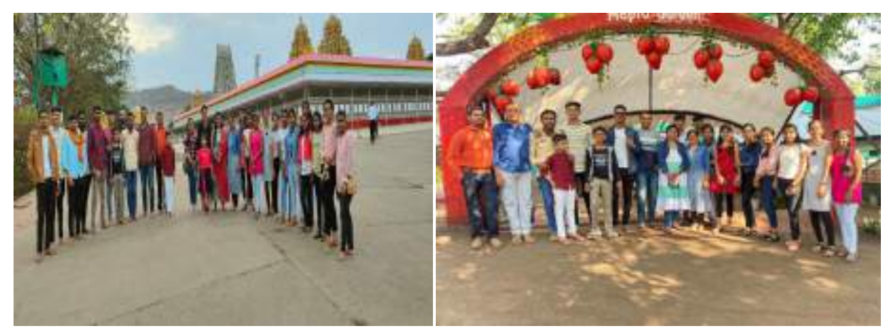
Second Year D. Pharmacy students of RJS College of Pharmacy, Kokamthan at Pratibalaji Khed, Pune and Mepro Garden, Mahabaleswar with their Staff