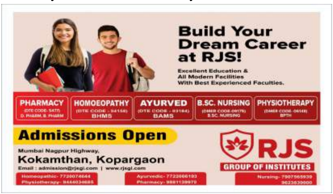
Admission card of RJS College of Pharmacy Kokamthan

Rashtrasant Swami College of Pharmacy, Kokamthan had prepared an admission card for the admission process of D. Pharmacy as well as B. Pharmacy.