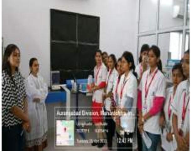
Final Year Students of Rashtrasant Janardhan Swami College of Pharmacy, Kokamthan get Interacted with Shodh Advantech , Sambhajinagar Committee Members

Industrial Visit is an essential part of the academic curriculum in most of the Graduate and Post-graduate courses. Being a part of interactive learning, such educational visit give