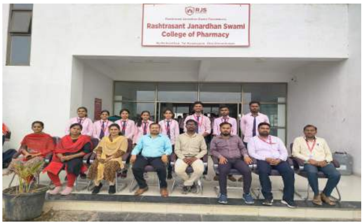
Rashtrasant Janardhan Swami College of Pharmacy, Kokamthan Staff Members with students of Final year B.pharmacy which are selected in Campus selection.