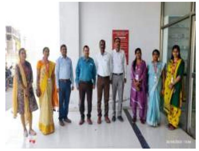
Rashtrasant Janardhan Swami College of Pharmacy, Kokamthan Staff Members with External Academic Monitoring Committee of MSBTE